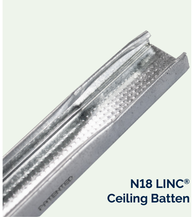
N18 LINC ® Ceiling Batten

N18 LINC ® Ceiling Batten is manufactured in Australia. All products manufactured by NASHCO are designed and engineered in accordance with Australian Standards.